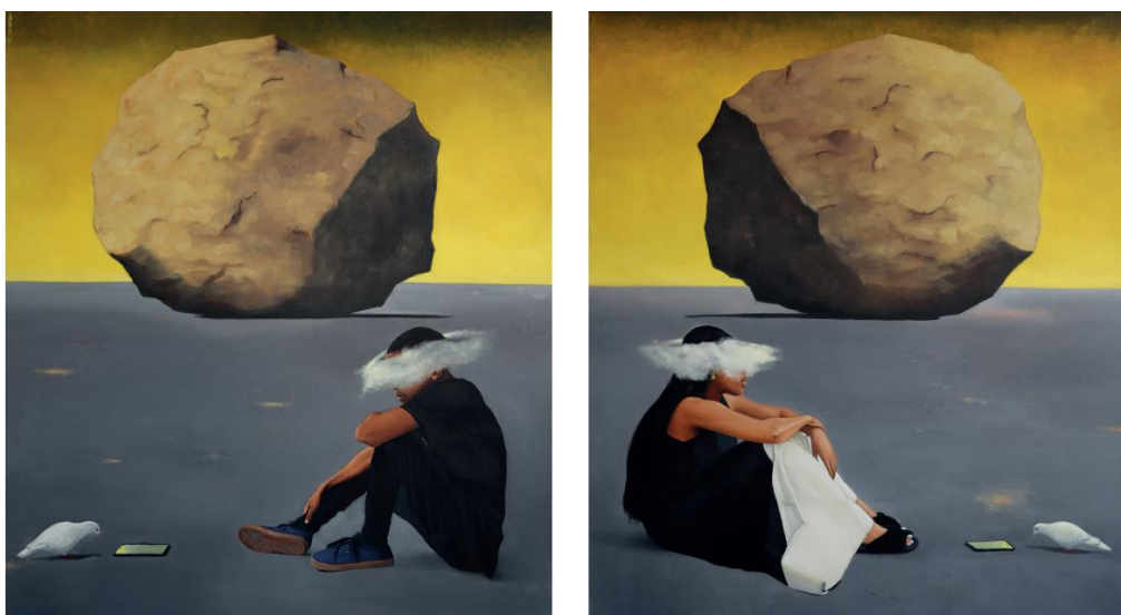
"P/ride or die" Oil on canvas 90 x 100 cm 2021

2020 - SAFFCA Artist of The Month September