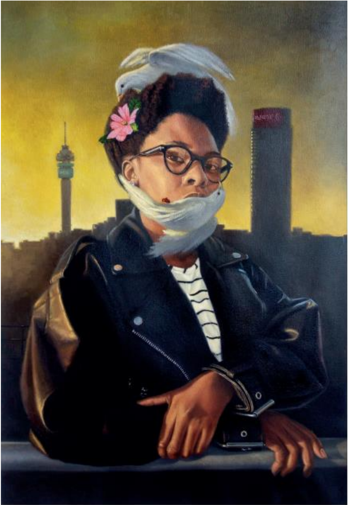
"Hair beauty" Oil on canvas 53 x 77 cm 2020