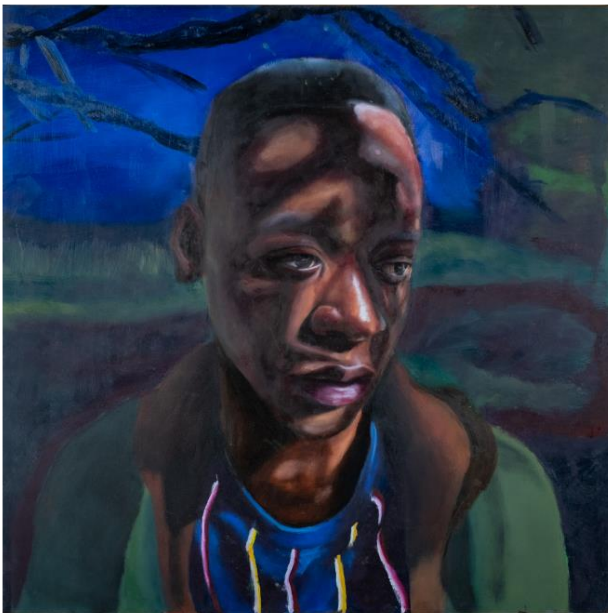
“Andiqondakali” Oil on Board 2021