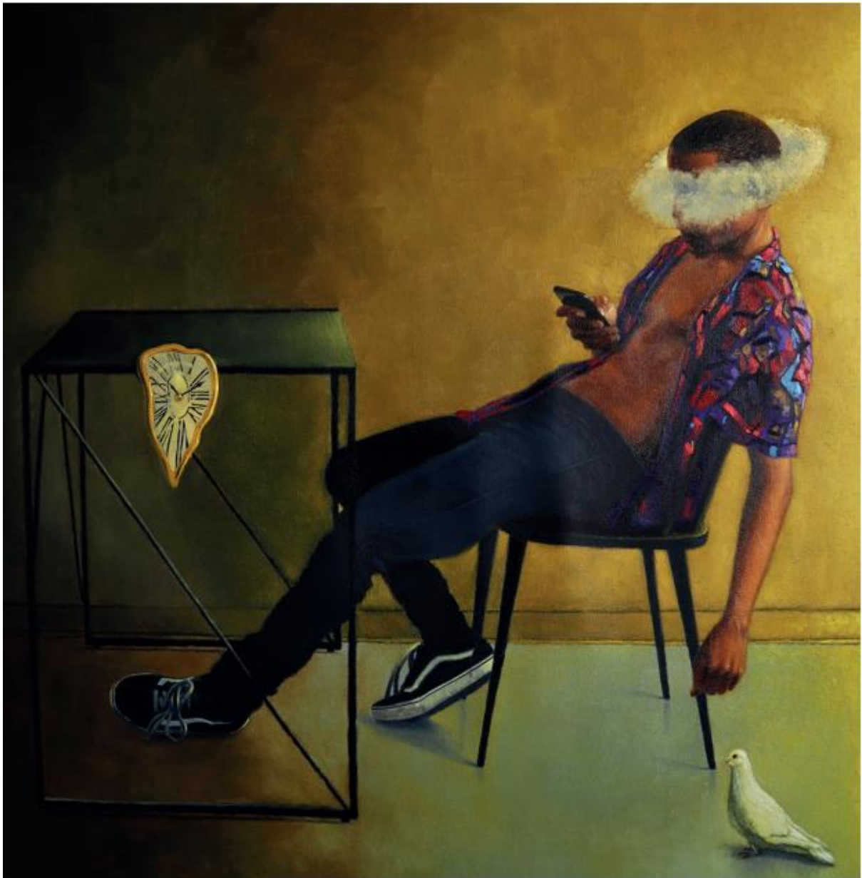
"Sleep state" Oil on canvas 84 x 85 cm 2020