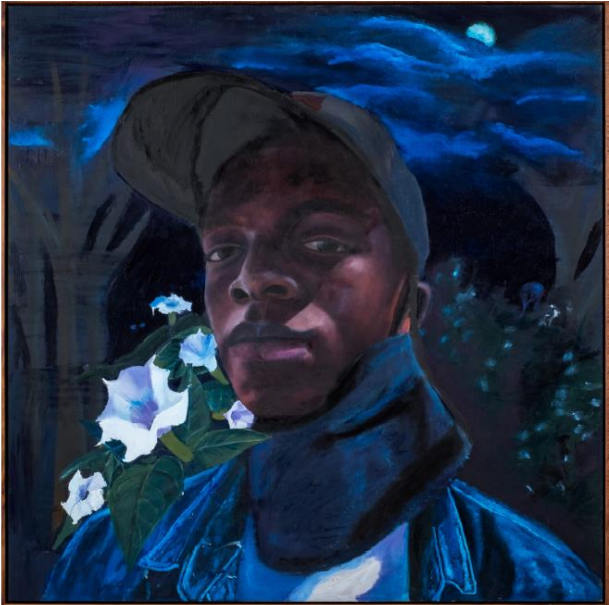
"Datura Noir" Oil on Board 2021