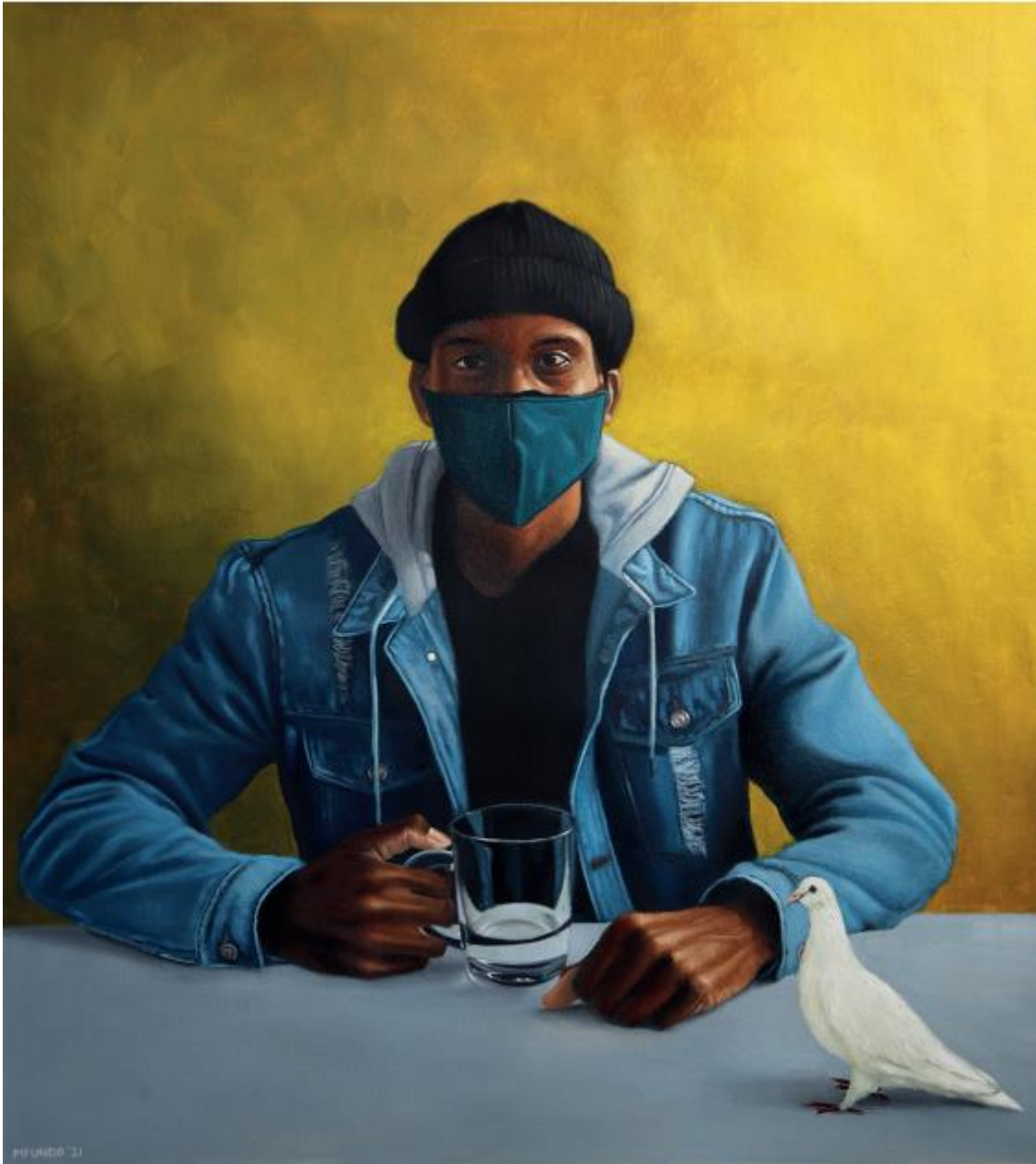
"A metaphor" Oil on canvas 90 x 100 cm 2021