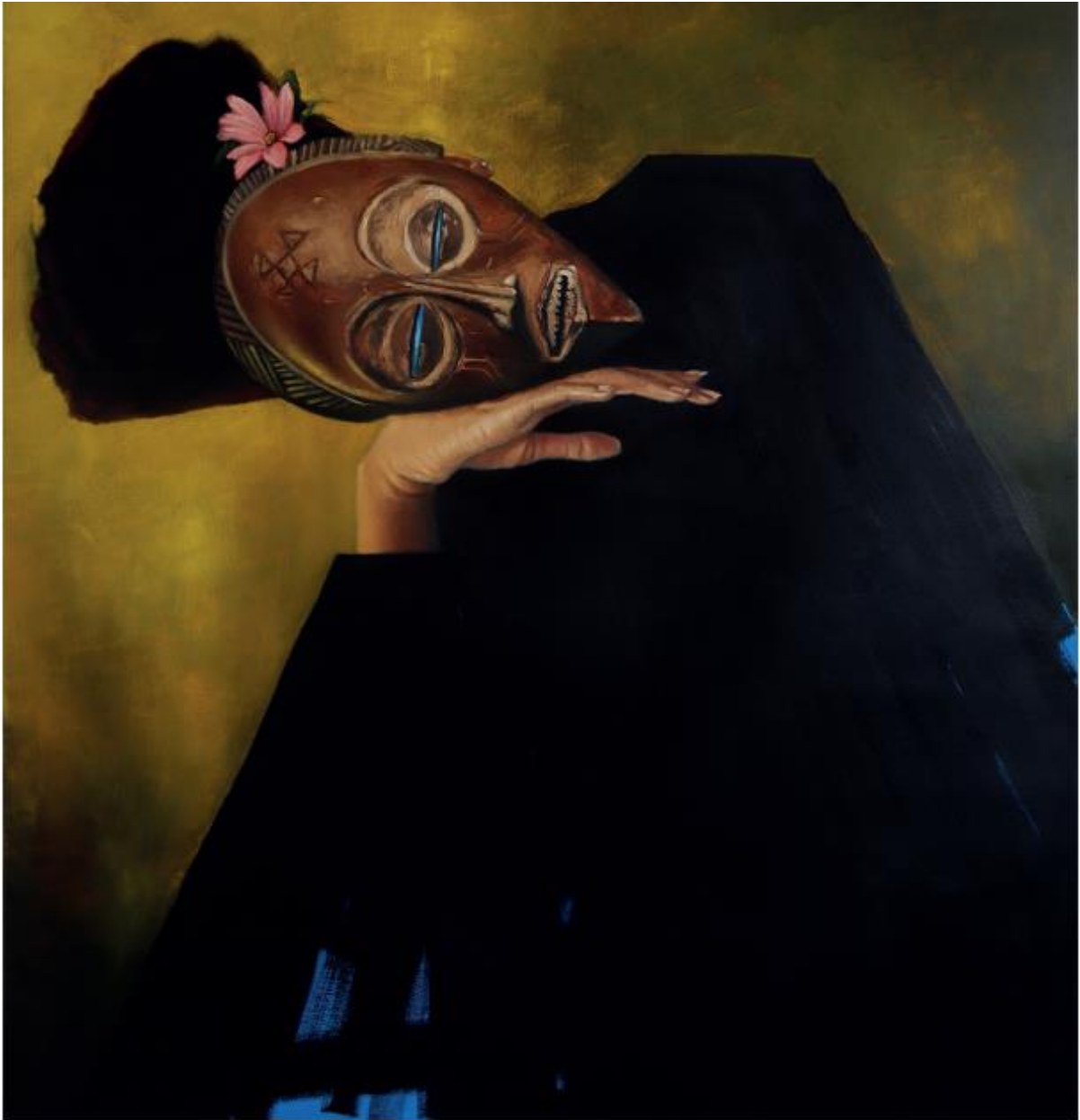
“Goddess of beauty” Oil on canvas 97 x 101 cm 2020