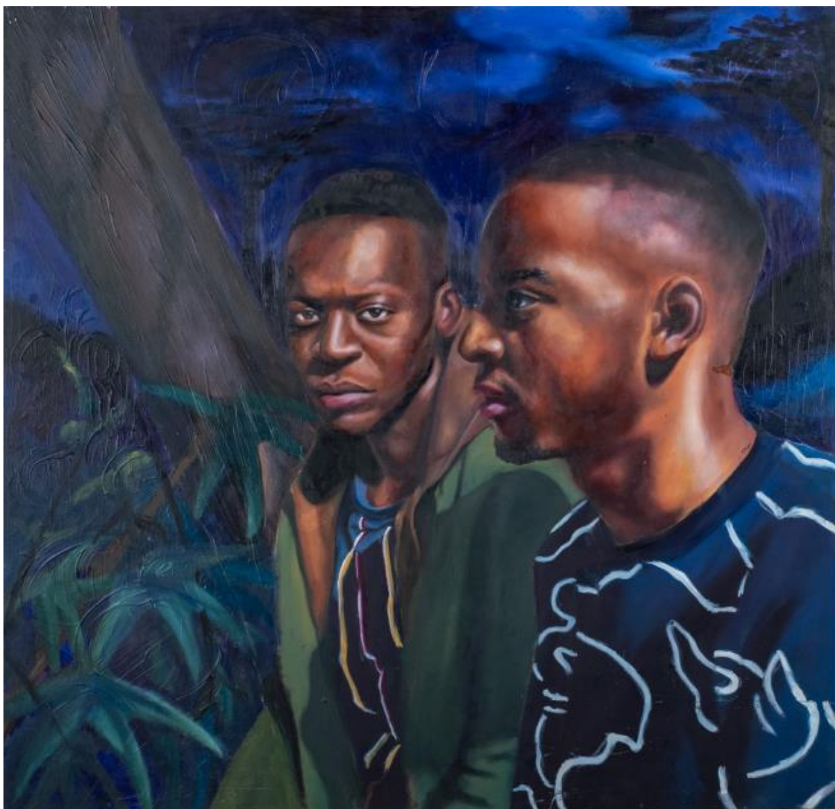
"U Grand Joe" 2021 oil on Board