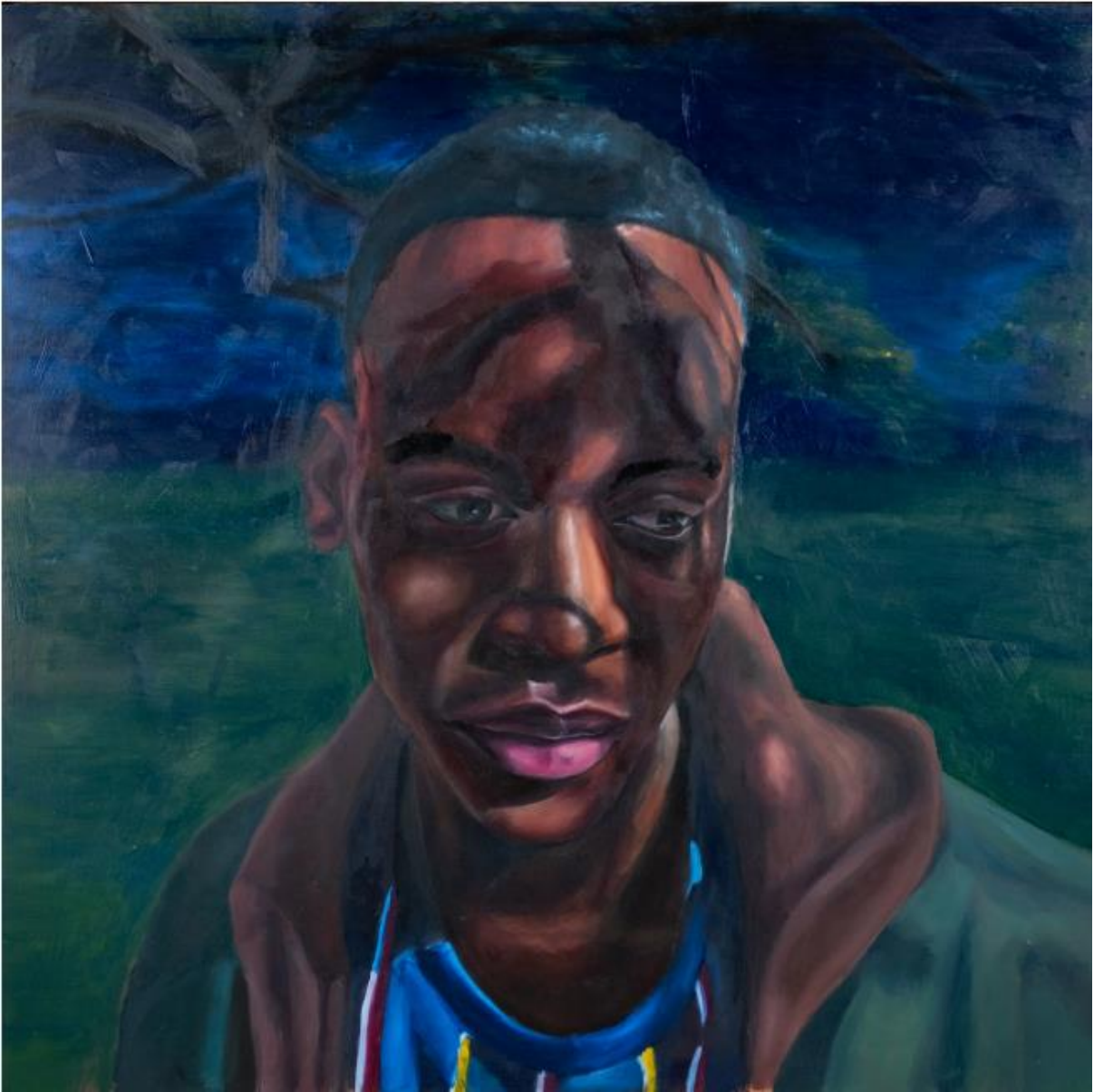
“Emvakwomti KwaLindokuhle” 2021 Oil on Board