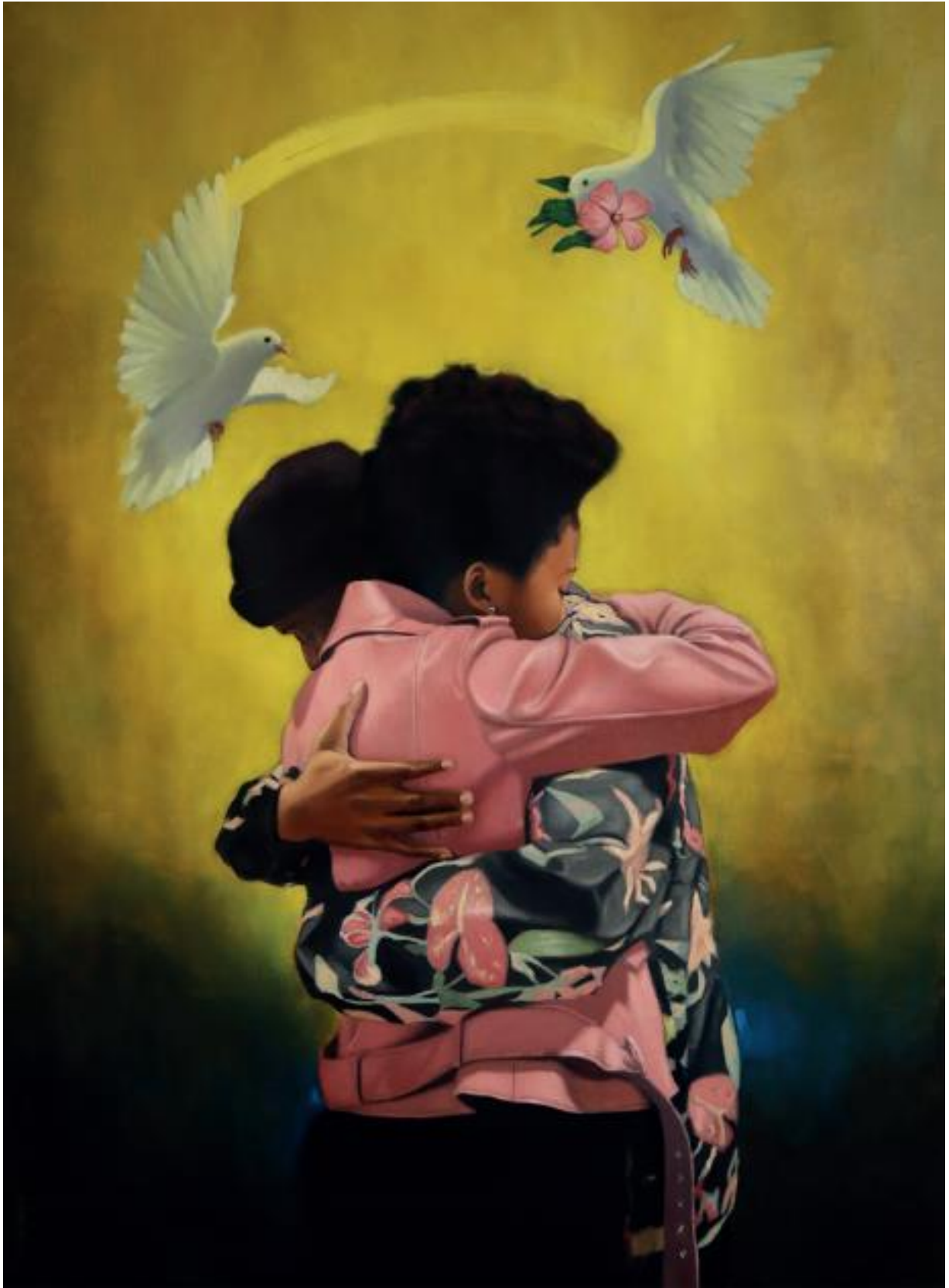
"The Essence" Oil on canvas 92 x 124 cm 2021